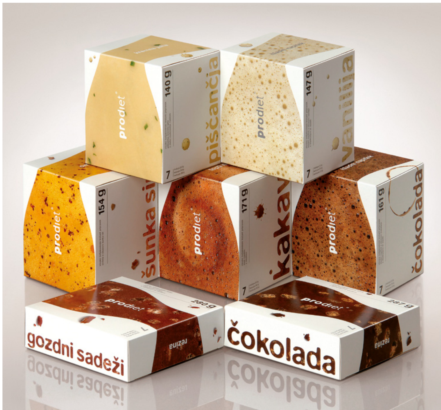
5 Prodiet packaging design Client: Difar CD+AD: Vladan Srdic