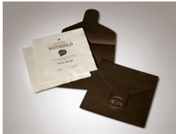
2 The Justice Day packaging & corporate identity Client: Ministry of Justice of Republic of Slovenia CD+AD: Vladan Srdic